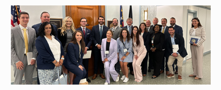
NCHCFA members with Sen. Thom Tillis