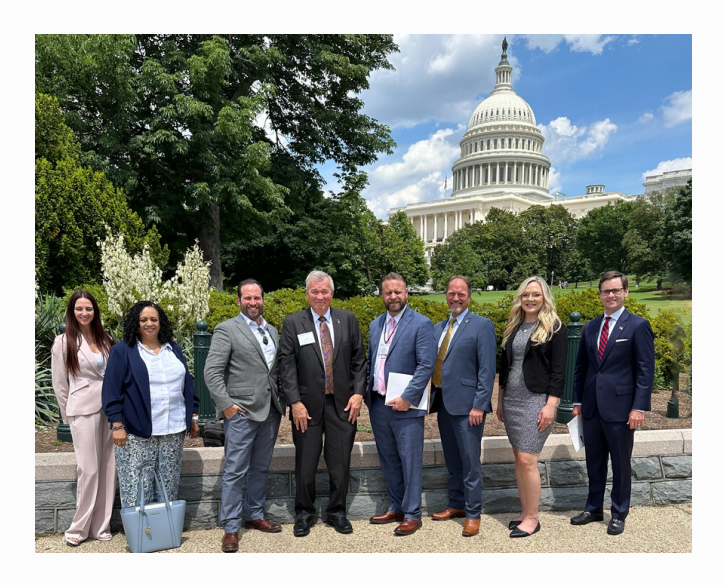
NCHCFA members in front of the U.S. Capitol